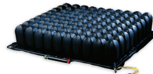
QUADRO SELECT® CUSHION