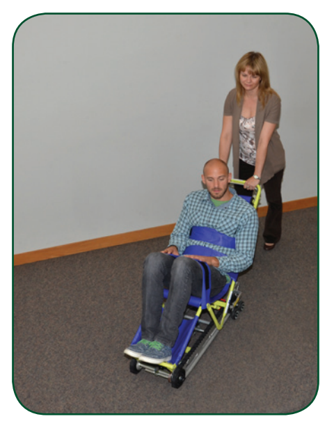
To turn the Evacu-Trac on flat surfaces, the attendant pushes down on the handle and pivots the unit on the rear auxiliary wheels.