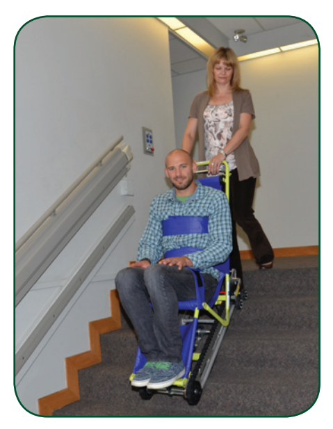
During descent the passenger sits in a comfortable, upright position, securely held by three safety straps.

During an emergency, the passenger is transferred from their wheelchair to the Evacu-Trac. Once positioned in the Evacu-Trac, velcro straps are wrapped securely around the passenger's torso and lower legs. The passenger is then wheeled to the stairway for descent.