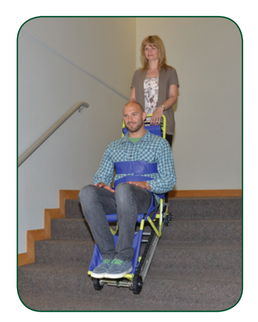
When ready to descend the next flight, the attendant squeezes the Brake Release Bar to release the secondary, failsafe brake.