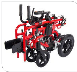
Folds for Easy Transport