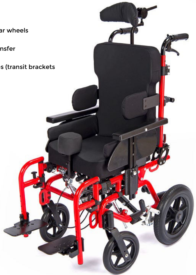
Seating system sold separately