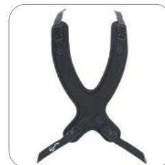
Poziform Contoured Chest Harness