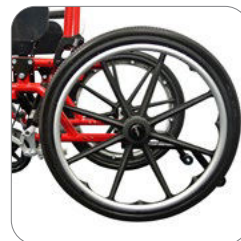
20" Rear Wheel Assembly