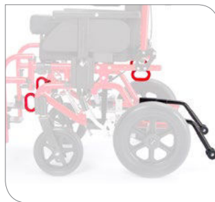
Standard Transit Brackets & Anti-Tipper