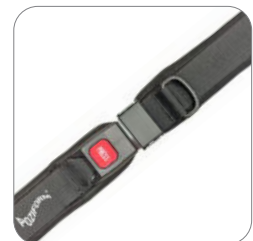
Poziform Padded Pelvic Belt