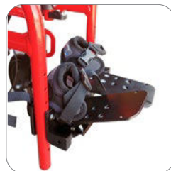
Angle Adjustable Footplates