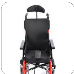
Rehab Style Seating System

See our Poziform brochure for more positioning product offering!