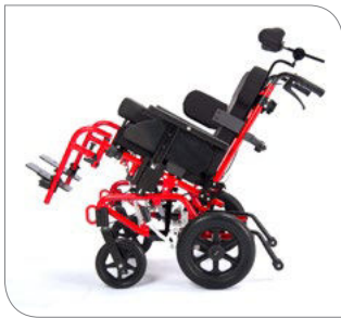
Tilt & Recline

For children and young adults in need of minimal to moderate support, The Kanga wheelchair offers tilt-in-space adjustability to maintain a proper sitting posture. The Kanga wheelchair grows from 10" to 14" width and offers 45° of tilt for pressure relief and gravity assisted positioning. For use with Inspired by Drive newly available complex rehab seating option. Also accommodates other manufacturer's seating.