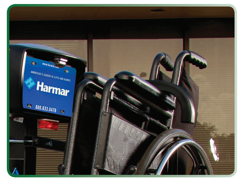
Adjustable hold-down arm safely secures wheelchair for transport.