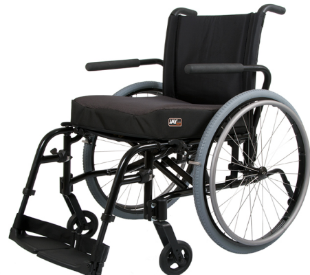
Quickie QXi featuring the Jay ION™ cushion