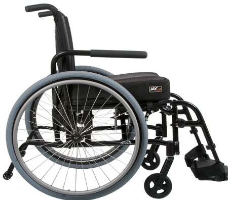
Quickie QXi, Ultra Lightweight Adjustable Folding Wheelchair