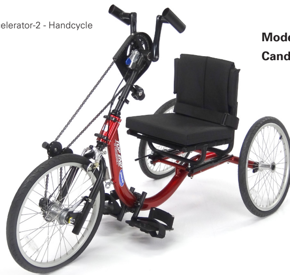
Model #: LXC2H Candy Apple Red