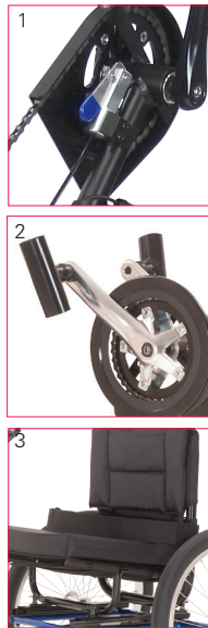
Li'l Excelerator-2 - Handcycle

Locking parking brake 153 mm crankset with one chain ring Ergonomic handpedals 20" Cruiser wheels and tires Quick release axles 9° camber Cushion and hook and loop seat restraint Candy Apple Red paint Weight capacity 175 lb.