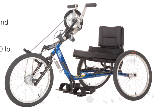
Model #: LXC Royal Blue

20" Cruiser wheels and tires Quick release axles 9° camber Cushion and hook and loop seat restraint Choice of 11 colors Weight capacity 250 lb.