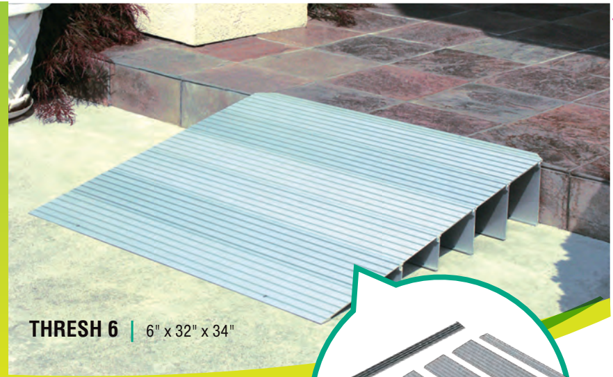
THRESH 6 | 6" x 32" x 34"