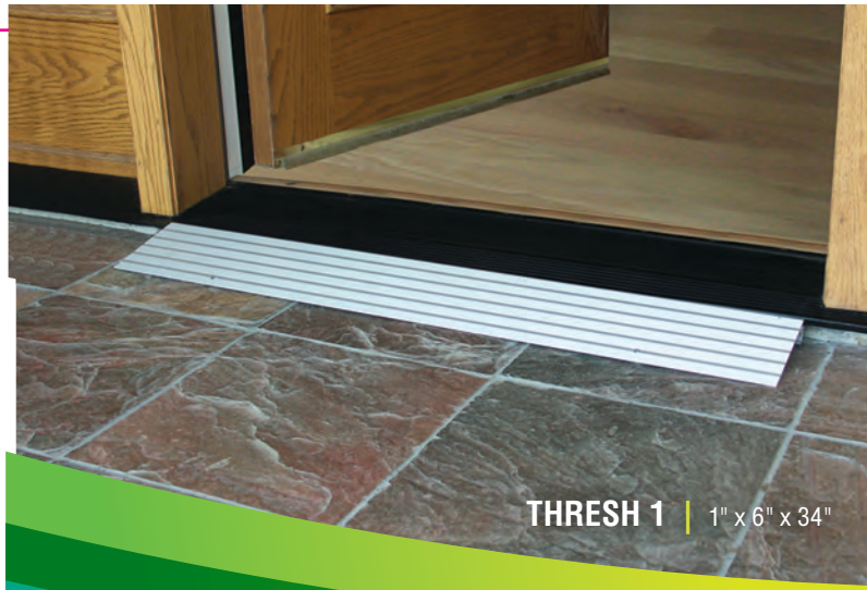
THRESH 1 | 1" x 6" x 34"