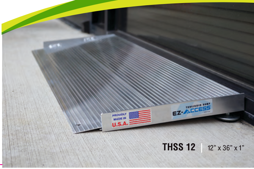
THSS 12 | 12" x 36" x 1"