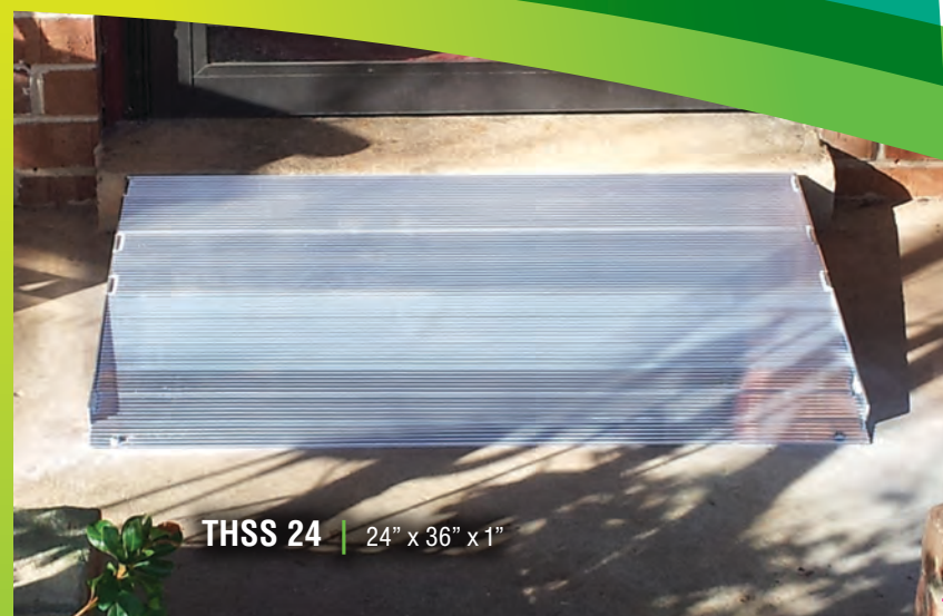
THSS 24 | 24" x 36" x 1"