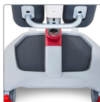
Set of inlay Inlays for footplate and footboard with slip-resistant material to increase friction. Set of inlay ..... 2920151

For the latest news and continuously updated product information – visit: www.etac.us.com