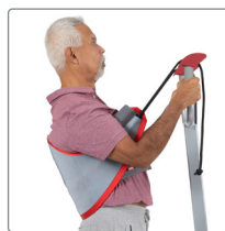
RgoSling StandUp sling The 2-point sling is available in sizes XS to XL. Additional variant is available when more pelvic support is needed. For item numbers and measurements see www.etac.com