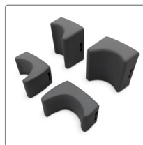
Set of Cushions Only contains cushions, no leg straps. Set of small cushions..... 2910076 Set of large cushions ..... 2910077