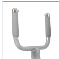
Clip sling lifting arm For clip slings