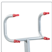
Active lifting arm For RgoSling Active slings.