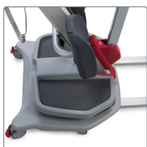
Footboard This accessory benefits a 10 cm (4inch) elevated footrest. The attachment key is easy accessible and makes it convenient to lock or unlock the accessory to the Quick Raiser. Footplate..... 2910065