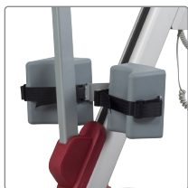
Bracket & Cushions kit The alternative leg supports benefits an option of small or large cushions, and a leg strap for safety measurements Kit with bracket & small cushions ... 2910059 Kit with bracket & large cushions .... 2910056