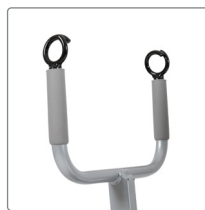
Loop lifting arm For loop slings