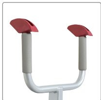
StandUp lifting arm For RgoSling Standup slings.