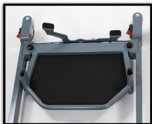
Non-slip footplate provides stable base for transfer