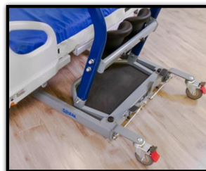
Underbed clearance, allows use with most low beds