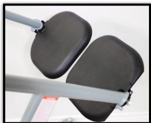
Swing-away padded seat for secure, comfortable transport