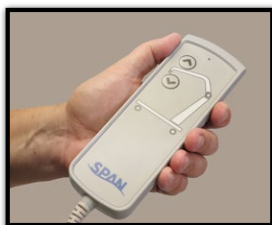
2-button pendant with LED indicator.