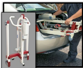
Folds flat for easy transport and storage.