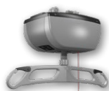
Fixed and portable lithium-ion overhead lifts