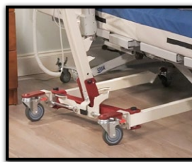
Underbed clearance allows use with most low beds.