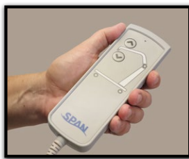
2-button pendant with LED indicator.