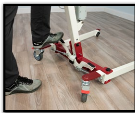
Foot pedal base width adjustment.